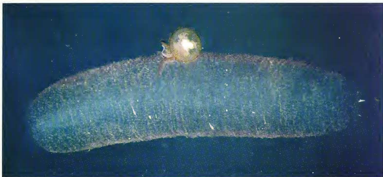
Fig. 2. Thysanoteuthis rhombus egg mass observed in the harbour of Reggio Calabria (southern Italy).